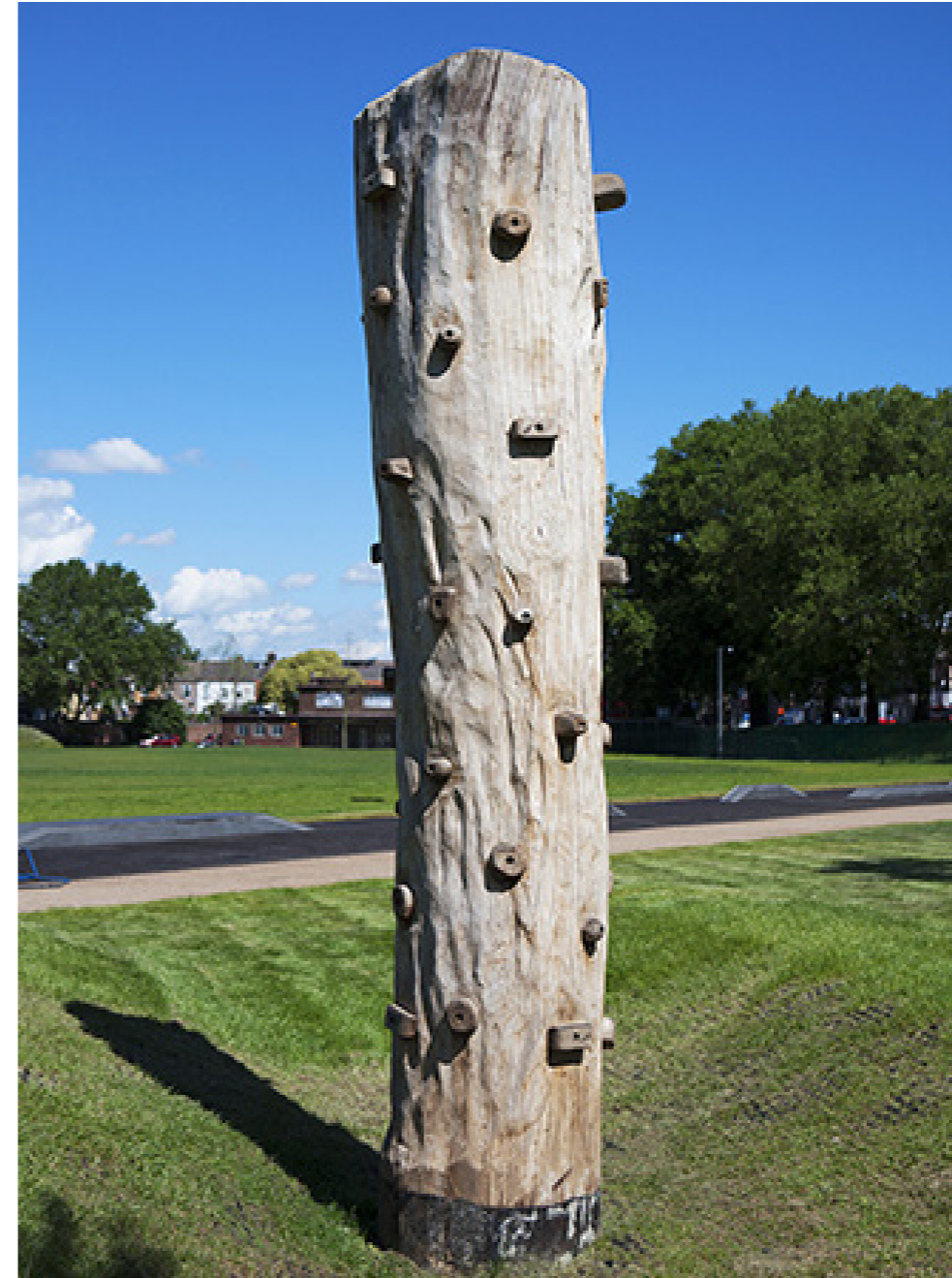
Top left: Youth Shelter Bottom left: Stepped grass seating Right: Climbing log